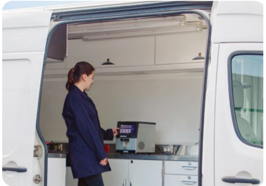
Mobile Lab is enclosed climate controlled lab with ambient temperature and humidity within product specification to obtain desired performance.

OptiFuel's handle and small foot print provides the perfect mobility for any remote field requirements.