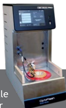
OptiFlash Small Scale Flash Point Analyzer