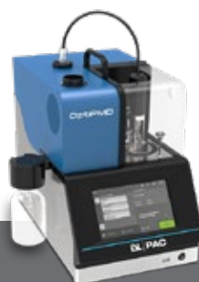
OptiPMD Micro Distillation Analyzer