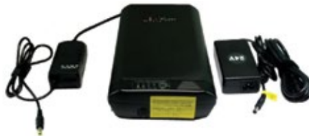
High-performance lithium ion battery with power supply